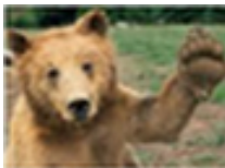
Middle School High Five!