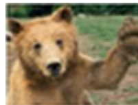
Middle School High Five!