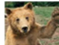
Middle School High Five!