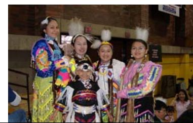
Students participate in cultural dance at the IEP Evening Program session.

Classes are offered in 30-minute sessions by grade level, including: Math and Reading Tutoring for Grades K-12; Homework Help for Grades K-12; Family Cultural Arts and Crafts Projects; Open Gym; Alaska Native Languages Classes-Yupik and Tlingit. For more information, contact our Office at 742-4445.