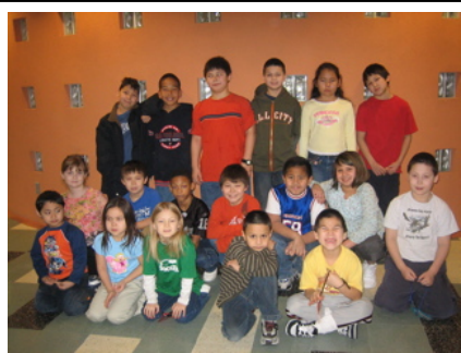
Williwaw Elementary School Team Photo.