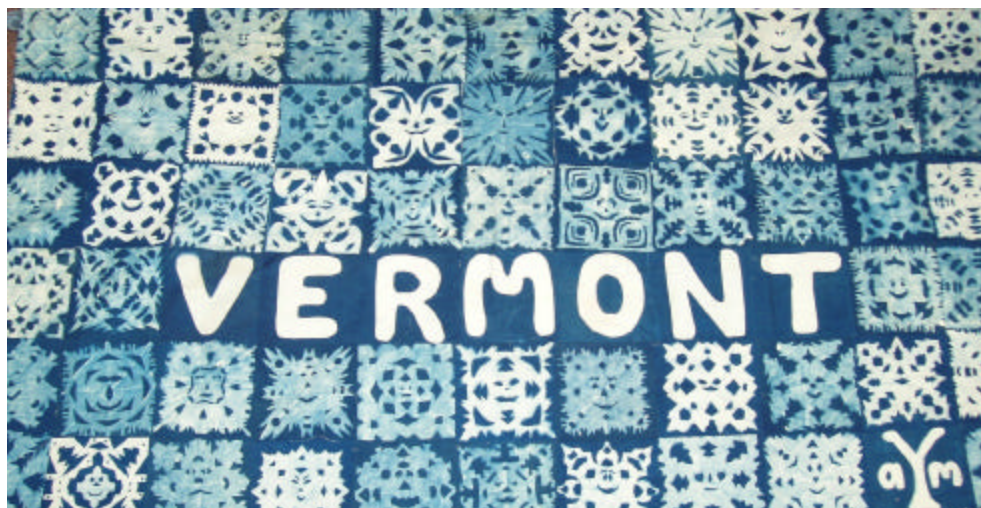
Vermont YAM Flag by: 3 rd and 4 th Grade Students at Randolph Elementary School, Randolph, VT

You may also plan a demonstration of pupils at work or parent participation with art materials in the regular classes with the children. You could arrange for a film to be shown.