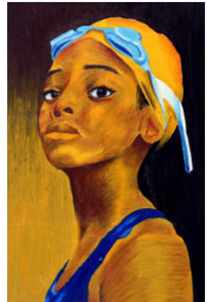
By Mayra Marin: age 13, Brownsville, TX

All children deserve art opportunities to draw what they see, what they feel, what they dream. At home and at school, your child deserves surroundings rich in expressive opportunities. Now, more than ever, in the present day atmosphere of energy crisis, environmental pollution, hunger crises, civil war and economic problems, our students need an outlet for their emotions.