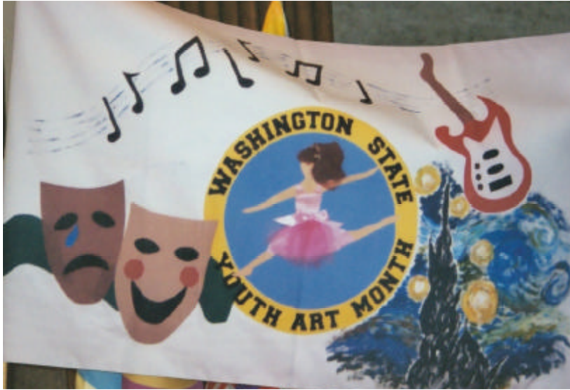
Washington YAM Flag by Bobby Gass: 9 th grade, Bellingham, WA