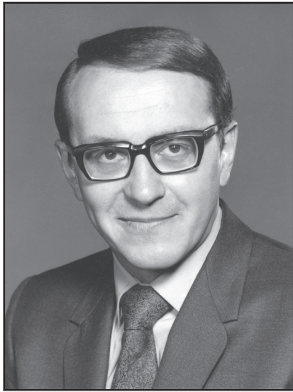
Nicholas J. Begich 1932-1972

Nicholas J. Begich was born the son of Croatian immigrants and raised in Eveleth, Minnesota. Though the youngest of four children, Nick was the first to attend college. He earned a BA from Saint Cloud State University and a Master's Degree from the University of Minnesota. Nick also pursued a Doctorate in Education at the University of Colorado and the University of North Dakota.