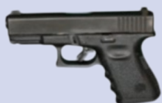
Real Glock Handgun