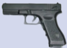
Airsoft Glock Handgun

Airsoft guns are not allowed in ASD schools. Students found with airsoft guns on school grounds or school-sponsored events will face disciplinary action.