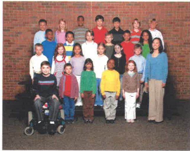
Design and class posing may vary by school. La pose de la clase y el diseño pueden variar según la escuela

Questions? Please contact Customer Service at 800-244-4373.