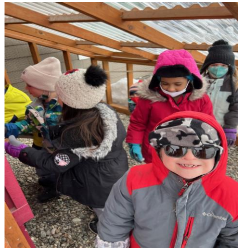
Grade 1 cleaning the coop