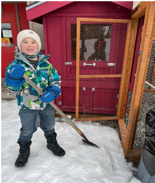
Grade 1, outside games