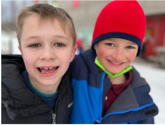
Grade 1 Ice sculpture