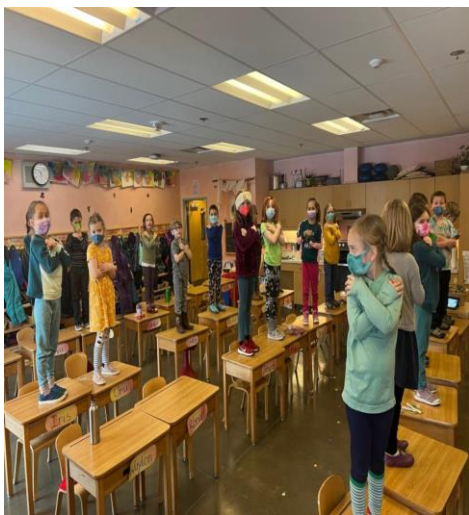
Grade 1 another perspective