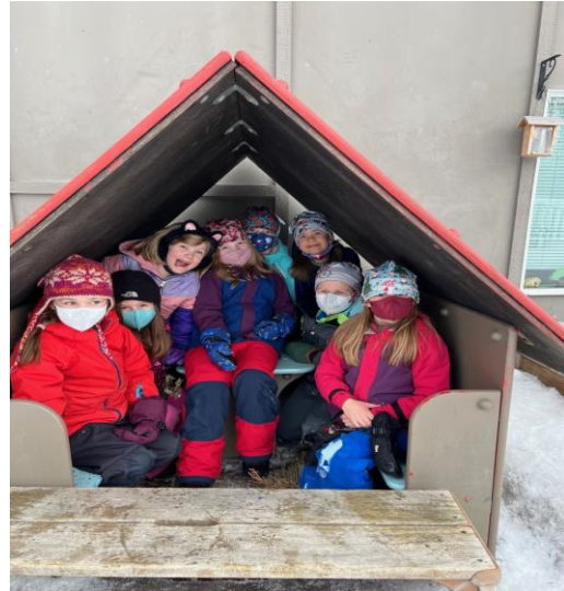
Grade 1 fun at recess