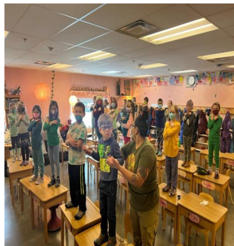
Grade 1 "What do you see from here?"