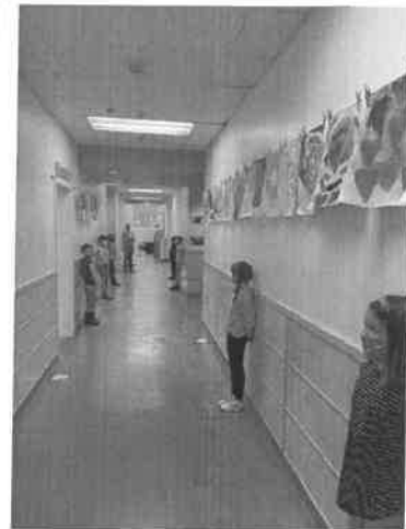
Grade 3 on their stickers waiting for their turn

Winterberry | 4802 Bryn Mawr Court, Anchorage, AK 99508