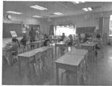
Grade 2 classroom