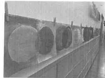
Grade 6's Venn Diagrams