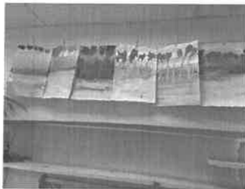
Grade 2's Watercolor Garden