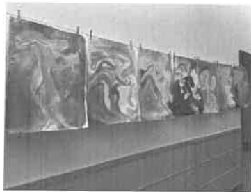
Grade 5's Maps