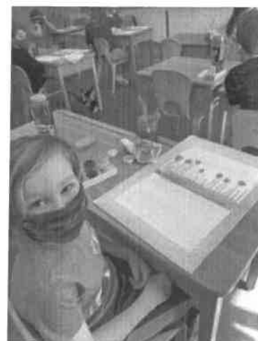
Grade 2, Hadley