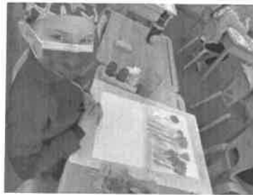
Grade 2, Orrin