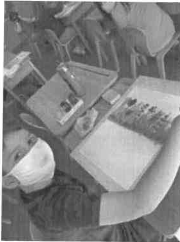
Grade 2, Sage