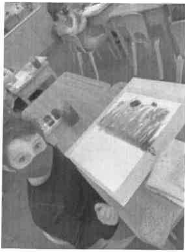
Grade 2, Wilder