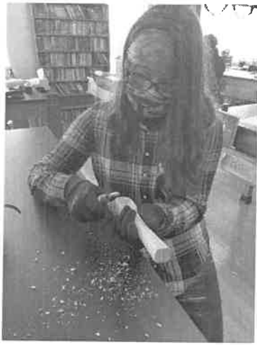
Grade 7, Cedar