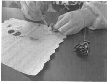
Painting Leather Roses