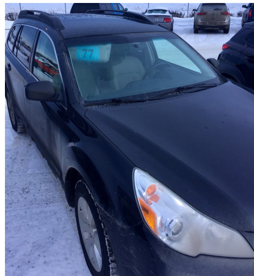
Example of displayed family number for student pick-up.