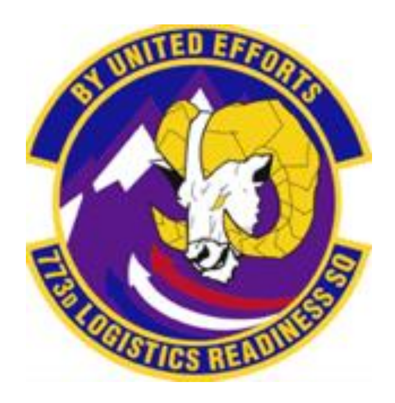
773 Logistics Readiness JBER, AK