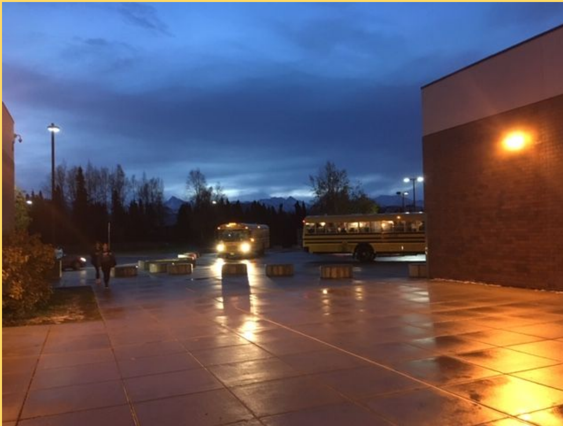
Students arriving in the dark at Mears at 8:00am.