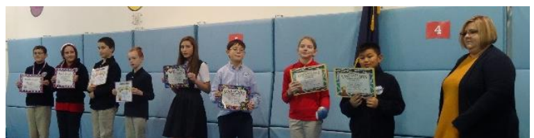
Awards Assembly