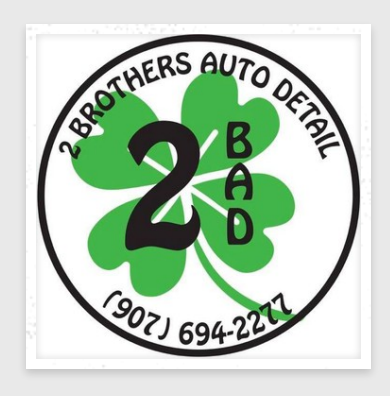
2 BROTHERS AUTO DETAIL