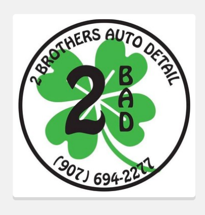
2 Brothers Auto Detail