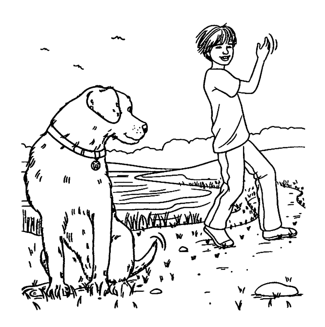
"Come with me, Wes."