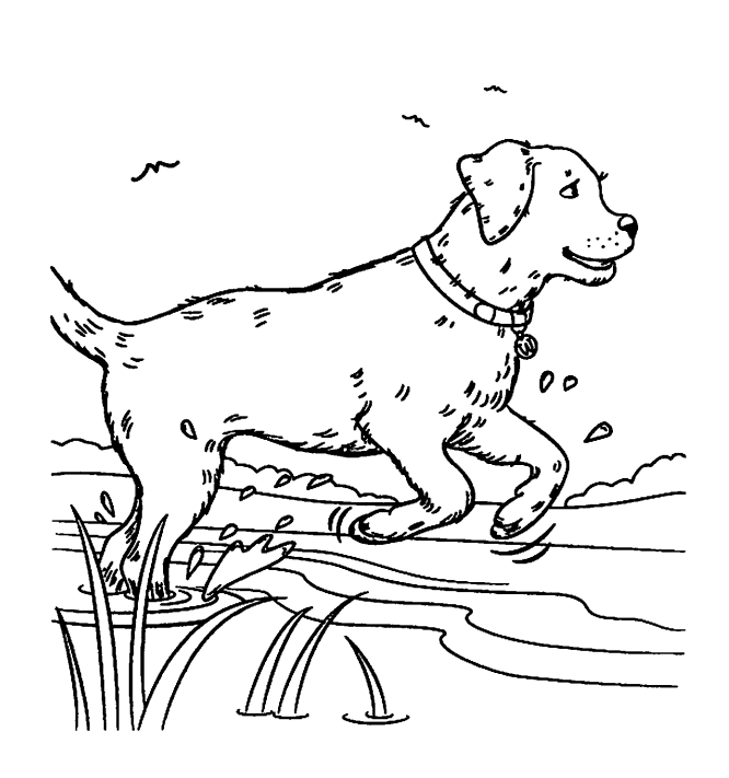
"Wes!" Wes got wet.