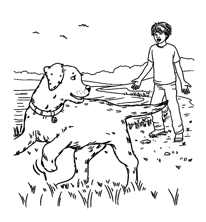
"Wes!" Wes ran and ran.