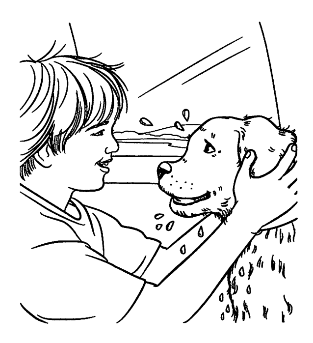
"Wes!" Wes got in. Sam got wet!