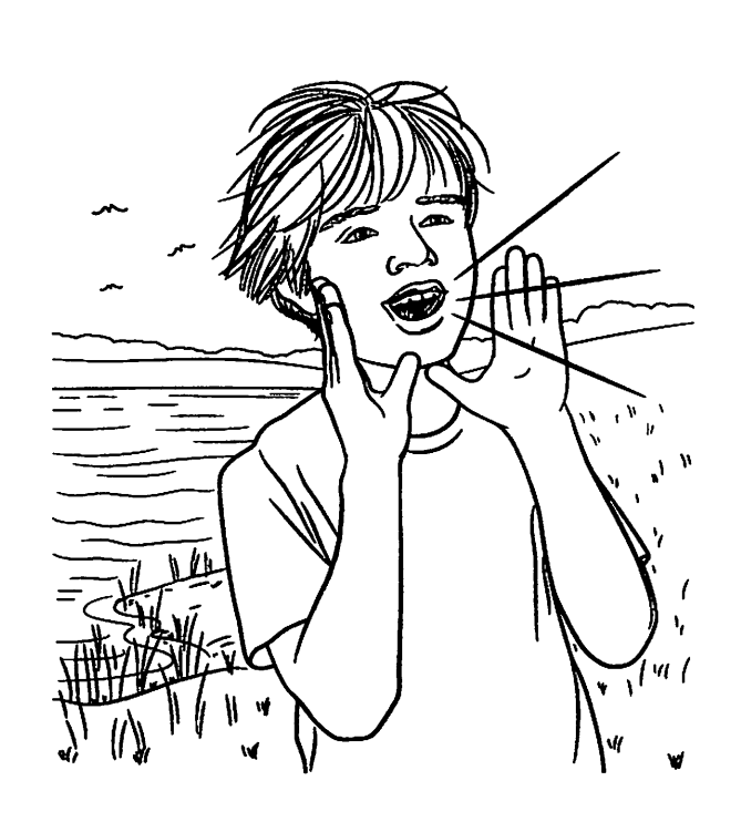
"Come with me, Wes."