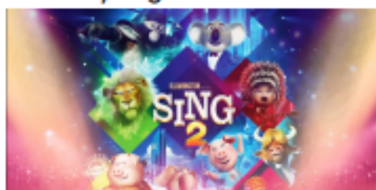
Monday, April 11, 6:00-8:00 pm Girdwood School Commons FREE ADMISSION

Snacks available for purchase Children 10 and under should have an adult with them.