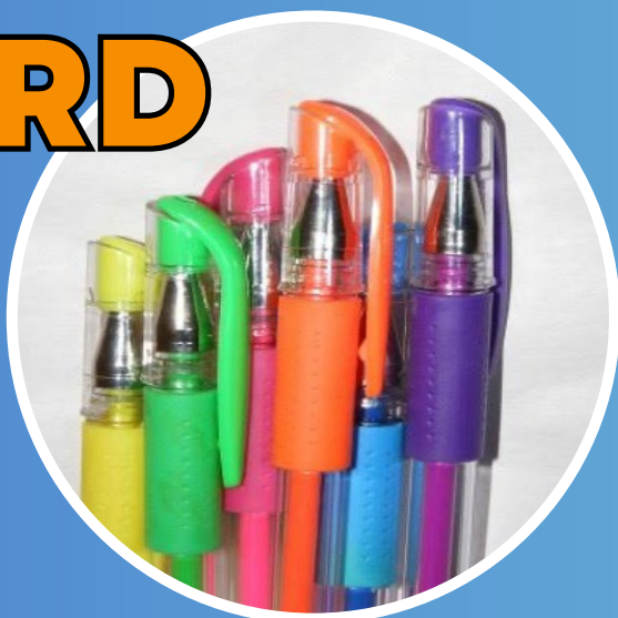
Colored Gel Pens