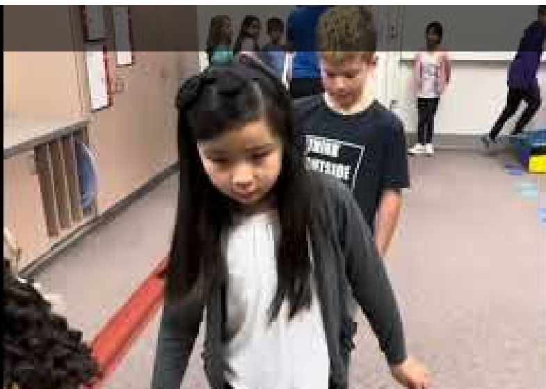
Kincaid In Motion

The sensory floors are available to all students throughout the school day. The motor lab is designed for a 10-minute, whole class or small group, movement break. Both require body control that helps students focus on instruction when they return to class. This project was sponsored by our Kincaid PTA.