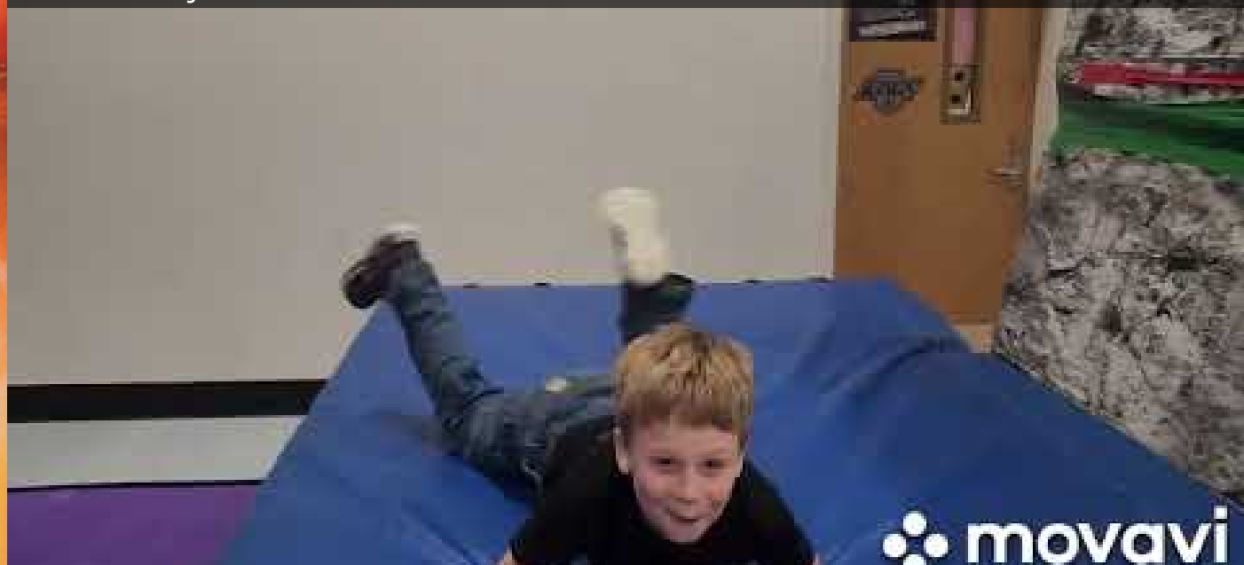
Kincaid Ninja Warriors