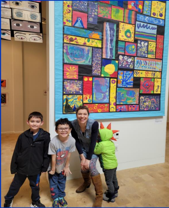
Taku Artists met Ms. Feucht at the Anchorage Museum to see our mural!