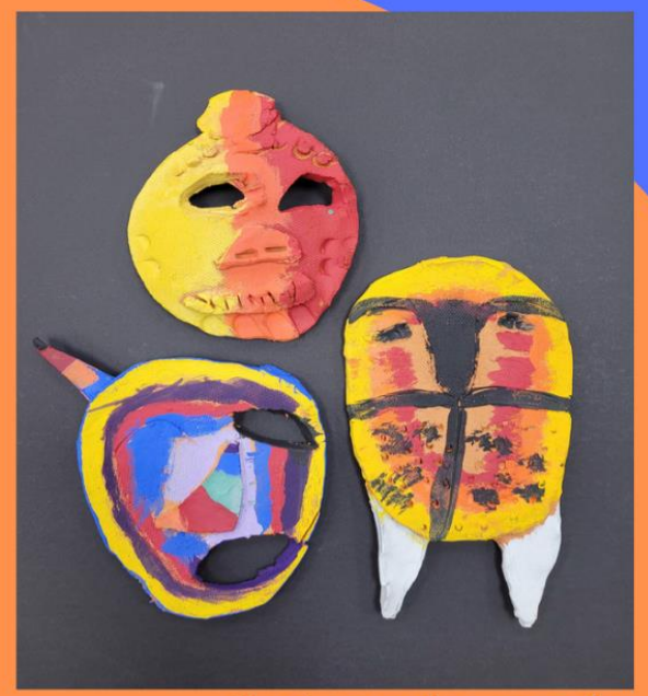
3rd grade made masks inspired by Alaska Native Art.