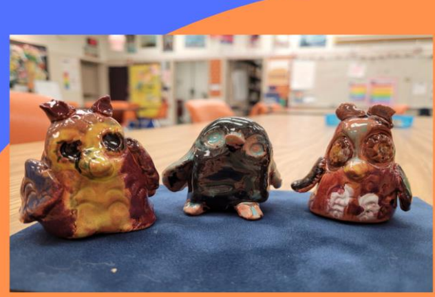
2nd grade made owls.