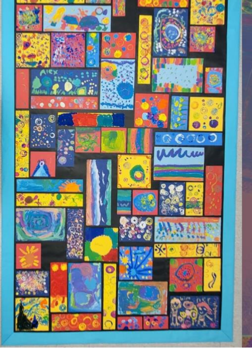
"The Dot" 1st and 2nd Graders Anchorage Museum