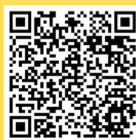
Sub & Interv.

Questions? Call us at 907-742-5940 or email Asktau@asdk12.org