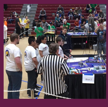
Then, on Saturday, January 19th our Robotics Team competed at the State Competition. Go Spacewolves!