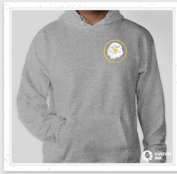
Hoodie Front Example