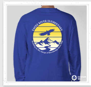
Long-sleeve Back Example