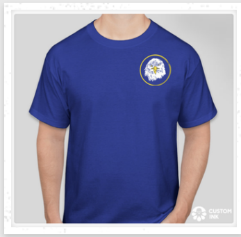
T-Shirt Front Example