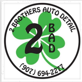
2 BROTHERS AUTO DETAIL